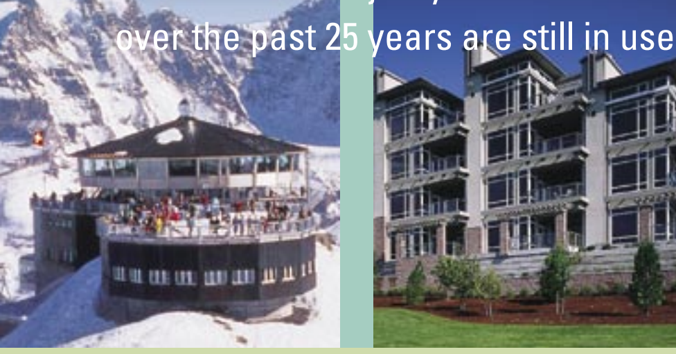
Piz Gloria ski lodge on Schilthorn mountain in the Swiss Alps